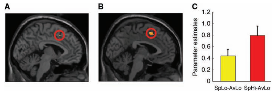
Fig. 1. Brain activation in dACC was modulated by relevance of comparison domain. Brain activations in response to (A) the SpLo minus AvLo condition and (B) the SpHi minus AvLo condition. (C) Mean for parameter estimates at the peak of dACC activation for SpHi-AvLo contrast (red) was greater than that for SpLo-AvLo contrast (yellow) ( t = 2.56 , P = 0.02 ). Error bars represent SE.

The self-rating results of the participants in the fMRI study were comparable to the results obtained in the initial survey. The mean values of the ratings of envy for students A, B, and C were 4.0 \pm 1.0 , 2.1 \pm 0.8 , and 1.0 \pm 0.0 , respectively. The mean values of schadenfreude for students A and C were