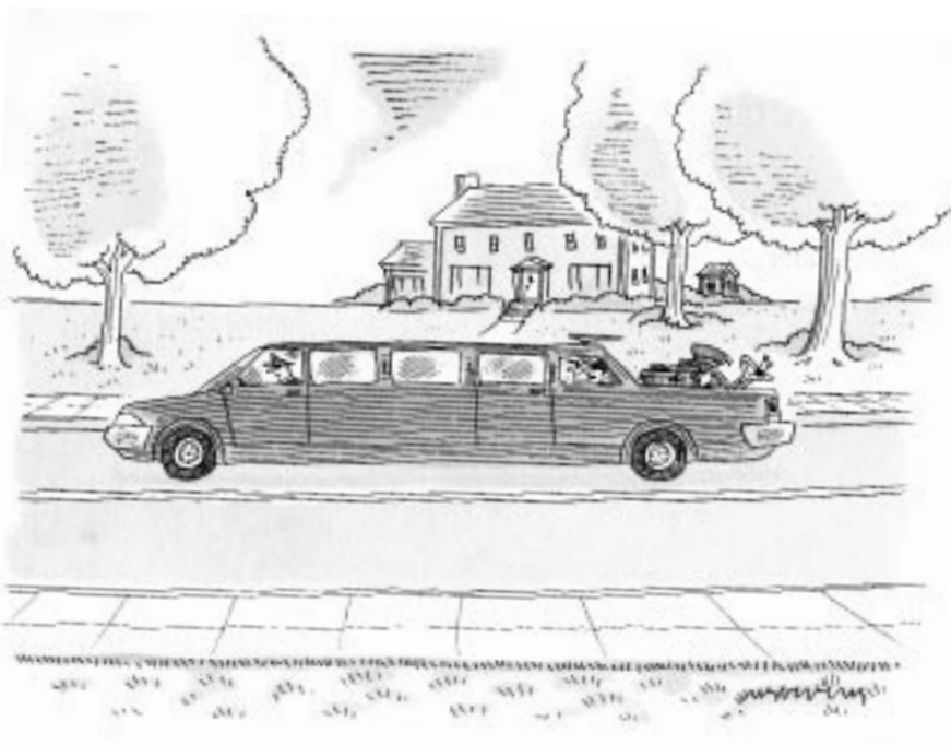
"Lawn care has been good to us, Ed."

But sometimes, just when the brain is about to give up, an insight appears.